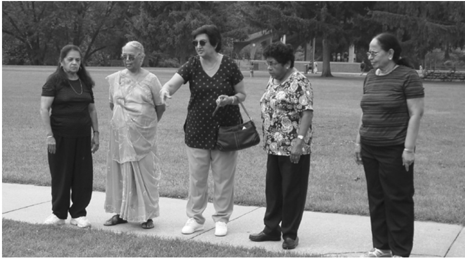
Asian Indian seniors enjoyed picnic at Flushing Park.